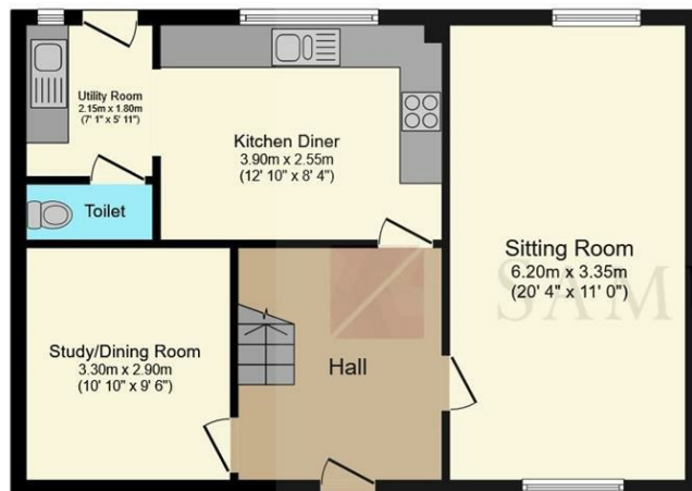
Ground Floor Floor area 60.3 sq.m. (649 sq.ft.)